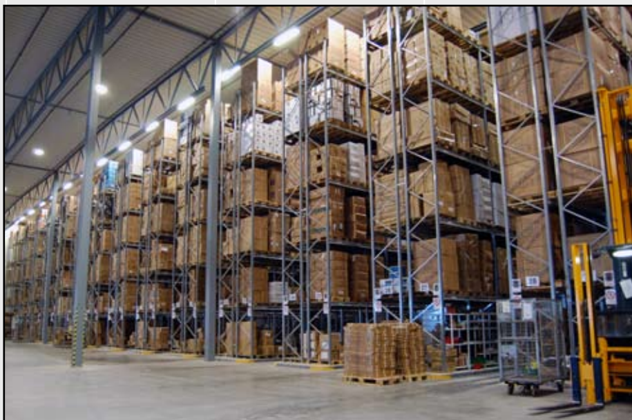
↑ Narrow aisle storage system, front and aisle. →