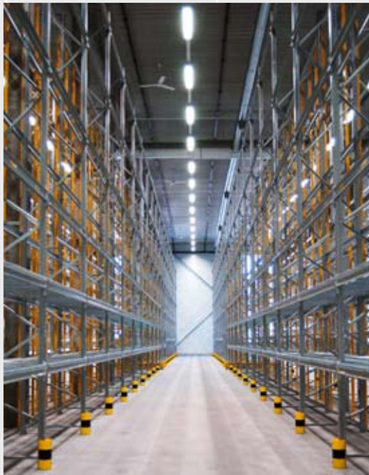
Upright protectors means safety and guiding