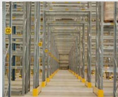
Frame protectors and tunnel guard