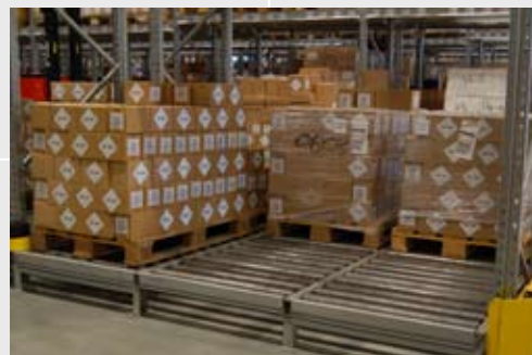
Drive-through on parts of the lower level